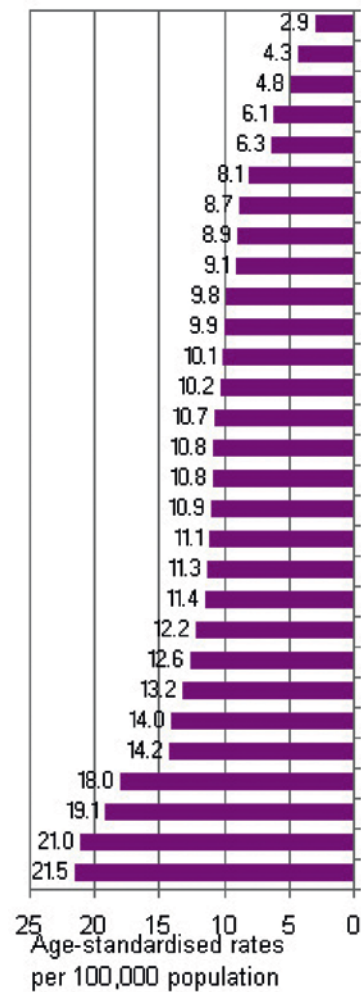
Suicide rates, total population, 2006 (or latest year available)